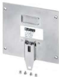
Adapter to mount SFNT switches on DIN rail in alternative position

Please be informed that the data shown in this PDF Document is generated from our Online Catalog. Please find the complete data in the user's documentation. Our General Terms of Use for Downloads are valid ( http://phoenixcontact.com/download )