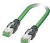
PROFINET patch cable, shielded, star-quad, 22 AWG stranded (7-wire), green, straight RJ45 male connector/IP20 to straight RJ45 male connector/IP20, length: 1.0 m

Patch cable - NBC-R4AC/1,0-93B/R4AC - 1408968