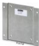
Mounting plate for SFNT switches

Mounting plate - FL PA SFNT 5-8 - 2891012