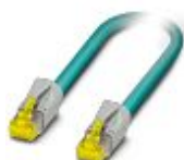
Patch cable, CAT6 A , 4-pair, shielded, connection not crossed (line), assembled at both ends with RJ45/IP20 connectors, outer sheath material: PUR, length: 3.0 m

Patch cable - NBC-R4AC/10G-R4AC/10G-94F/3,0 - 1408365