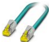
Patch cable, CAT6 A , 4-pair, shielded, connection not crossed (line), assembled at both ends with RJ45/IP20 connectors, outer sheath material: PUR, length: 2.0 m

Patch cable - NBC-R4AC/10G-R4AC/10G-94F/2,0 - 1408360