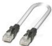
Patch cable, CAT5, assembled, 2 m

Patch cable - FL CAT5 PATCH 2,0 - 2832289