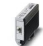
Surge protection in accordance with Class E A (CAT6 A ), for Gigabit Ethernet (up to 10 Gbps), token ring, FDDI/CDDI, ISDN, and DS1. Suitable for Power over Ethernet (PoE+) "Mode A" and "Mode B". RJ45 attachment plug with separate grounding cable and ground connection snap-on foot for NS 35 DIN rails.

Surge protection device - DT-LAN-CAT.6+ - 2881007