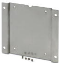
Mounting plate for FL SWITCH 30... and FL SWITCH 40... eight-port switches

Please be informed that the data shown in this PDF Document is generated from our Online Catalog. Please find the complete data in the user's documentation. Our General Terms of Use for Downloads are valid ( http://phoenixcontact.com/download )