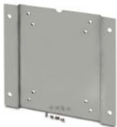
Mounting plate for FL SWITCH 30... and FL SWITCH 40... 16-port switches

Please be informed that the data shown in this PDF Document is generated from our Online Catalog. Please find the complete data in the user's documentation. Our General Terms of Use for Downloads are valid ( http://phoenixcontact.com/download )