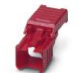
Lockable security element

Port Guard Security Element - FL PATCH GUARD - 2891424