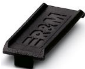
Color marking for FL PATCH GUARD, black

Please be informed that the data shown in this PDF Document is generated from our Online Catalog. Please find the complete data in the user's documentation. Our General Terms of Use for Downloads are valid ( http://phoenixcontact.com/download )