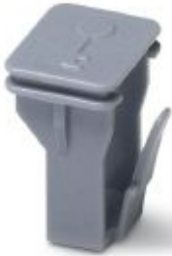
Locking element and key for security frame

Please be informed that the data shown in this PDF Document is generated from our Online Catalog. Please find the complete data in the user's documentation. Our General Terms of Use for Downloads are valid ( http://phoenixcontact.com/download )