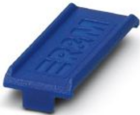
Color marking for FL PATCH GUARD, blue

Please be informed that the data shown in this PDF Document is generated from our Online Catalog. Please find the complete data in the user's documentation. Our General Terms of Use for Downloads are valid ( http://phoenixcontact.com/download )