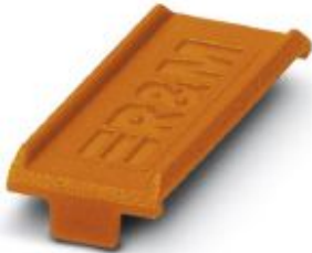
Color marking for FL PATCH GUARD, orange

Please be informed that the data shown in this PDF Document is generated from our Online Catalog. Please find the complete data in the user's documentation. Our General Terms of Use for Downloads are valid ( http://phoenixcontact.com/download )