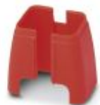
Security element for FL patch cable

Port Guard Security Element - FL PATCH SAFE CLIP - 2891246