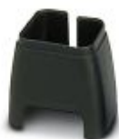
Color marking for patch cable, black