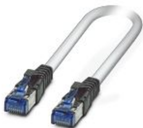
Patch cable, CAT6, pre-assembled, 1.0 m

Please be informed that the data shown in this PDF Document is generated from our Online Catalog. Please find the complete data in the user's documentation. Our General Terms of Use for Downloads are valid ( http://phoenixcontact.com/download )