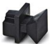
Dust protection caps for RJ45 socket

Dust protection - FL RJ45 PROTECT CAP - 2832991