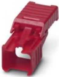
Lockable security element

Please be informed that the data shown in this PDF Document is generated from our Online Catalog. Please find the complete data in the user's documentation. Our General Terms of Use for Downloads are valid ( http://phoenixcontact.com/download )