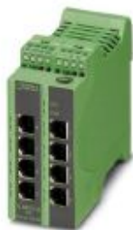
Ethernet Lean Managed Switch with eight 10/100 Mbps RJ45 ports, preconfigured for EtherNet/IP™

Please be informed that the data shown in this PDF Document is generated from our Online Catalog. Please find the complete data in the user's documentation. Our General Terms of Use for Downloads are valid ( http://phoenixcontact.com/download )