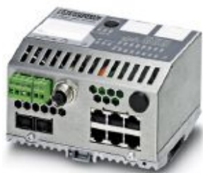
Ethernet Smart Managed Compact Switch with six 10/100/1000 Mbps RJ45 ports and two 1000 Mbps SFP slots

Please be informed that the data shown in this PDF Document is generated from our Online Catalog. Please find the complete data in the user's documentation. Our General Terms of Use for Downloads are valid ( http://phoenixcontact.com/download )