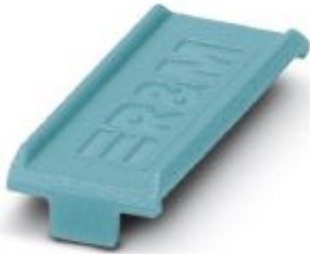
Color marking for FL PATCH GUARD, turquoise

Please be informed that the data shown in this PDF Document is generated from our Online Catalog. Please find the complete data in the user's documentation. Our General Terms of Use for Downloads are valid ( http://phoenixcontact.com/download )