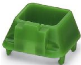
Security frame for SFN switch and patch fields, green

Please be informed that the data shown in this PDF Document is generated from our Online Catalog. Please find the complete data in the user's documentation. Our General Terms of Use for Downloads are valid ( http://phoenixcontact.com/download )