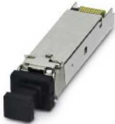
Gigabit SFP module for transmission up to 1 km with a wavelength of 850 nm.

Please be informed that the data shown in this PDF Document is generated from our Online Catalog. Please find the complete data in the user's documentation. Our General Terms of Use for Downloads are valid ( http://phoenixcontact.com/download )