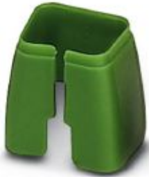
Color marking for patch cable, green

Please be informed that the data shown in this PDF Document is generated from our Online Catalog. Please find the complete data in the user's documentation. Our General Terms of Use for Downloads are valid ( http://phoenixcontact.com/download )