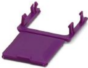
Dust protection with color marking for SFN switch and angled patch connector, purple

Please be informed that the data shown in this PDF Document is generated from our Online Catalog. Please find the complete data in the user's documentation. Our General Terms of Use for Downloads are valid ( http://phoenixcontact.com/download )