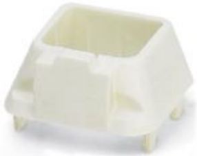
Security frame for SFN switch and patch fields, white

Please be informed that the data shown in this PDF Document is generated from our Online Catalog. Please find the complete data in the user's documentation. Our General Terms of Use for Downloads are valid ( http://phoenixcontact.com/download )