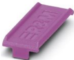
Color marking for FL PATCH GUARD, purple

Please be informed that the data shown in this PDF Document is generated from our Online Catalog. Please find the complete data in the user's documentation. Our General Terms of Use for Downloads are valid ( http://phoenixcontact.com/download )