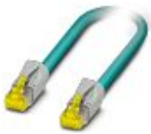
Patch cable, CAT6 A , 4-pair, shielded, connection not crossed (line), assembled at both ends with RJ45/IP20 connectors, outer sheath material: PUR, length: 2.0 m

Patch cable - NBC-R4AC/10G-R4AC/10G-94F/2,0 - 1408360