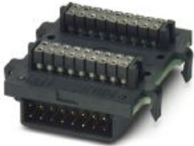
DIN rail connector, number of positions: 16, pitch: 2.54 mm, color: jet black

Please be informed that the data shown in this PDF Document is generated from our Online Catalog. Please find the complete data in the user's documentation. Our General Terms of Use for Downloads are valid ( http://phoenixcontact.com/download )