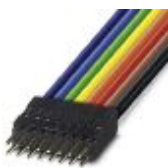
Power connector for DIN rail bus connector with 16 free cable ends with a cross section of 0.25 mm 2 , 500 mm long, male contacts