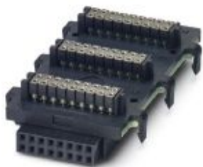
DIN rail connector, number of positions: 16, pitch: 2.54 mm, color: jet black

Please be informed that the data shown in this PDF Document is generated from our Online Catalog. Please find the complete data in the user's documentation. Our General Terms of Use for Downloads are valid ( http://phoenixcontact.com/download )