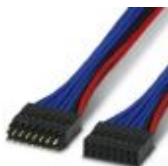
Cable bridge for cross-DIN-rail connection of the HBUS connector

Cable set - BSL-2,54/16-ST 40CM - 2202938