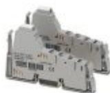
Inline distance terminal, without accessories

Inline terminal - IB IL DOR LV-SET - 2742641