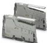
Connector set for distance terminal

Connector set - IB IL DOR LV-PLSET - 2742667