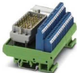
Interface module, connection 1: Screw connection 32-position, connection 2: ELCO connector 1x 32-position (Pin strip type 8016 (EEx i protection), right)

Please be informed that the data shown in this PDF Document is generated from our Online Catalog. Please find the complete data in the user's documentation. Our General Terms of Use for Downloads are valid ( http://phoenixcontact.com/download )