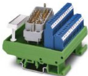
Interface module, connection 1: Screw connection 25-position, connection 2: ELCO connector 1x 25-position (Pin strip type 8016 (EEx i protection), right)

Please be informed that the data shown in this PDF Document is generated from our Online Catalog. Please find the complete data in the user's documentation. Our General Terms of Use for Downloads are valid ( http://phoenixcontact.com/download )