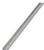
Continuous plug-in bridge, length: 500 mm, color: gray

Continuous plug-in bridge - FBST 500-PLC GY - 2966838