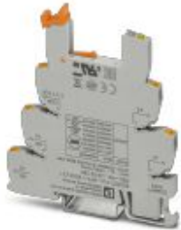
6.2 mm PLC basic terminal block with push-in connection, without relay or solid-state relay, for mounting on DIN rail NS 35/7,5, 1 PDT, input voltage 120 V AC/DC

Please be informed that the data shown in this PDF Document is generated from our Online Catalog. Please find the complete data in the user's documentation. Our General Terms of Use for Downloads are valid ( http://phoenixcontact.com/download )