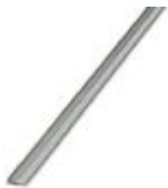
Continuous plug-in bridge, length: 500 mm, color: gray

Continuous plug-in bridge - FBST 500-PLC GY - 2966838