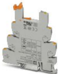
6.2 mm PLC basic terminal block with push-in connection, without relay or solid-state relay, for mounting on DIN rail NS 35/7,5, 1 PDT, input voltage 12 V DC

Please be informed that the data shown in this PDF Document is generated from our Online Catalog. Please find the complete data in the user's documentation. Our General Terms of Use for Downloads are valid ( http://phoenixcontact.com/download )