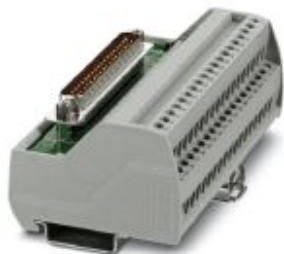
VARIOFACE module, with screw connection and male D-SUB miniature pin strip, for mounting on NS 35 rails, 37-pos.

Please be informed that the data shown in this PDF Document is generated from our Online Catalog. Please find the complete data in the user's documentation. Our General Terms of Use for Downloads are valid ( http://phoenixcontact.com/download )