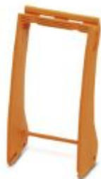
Relay retaining bracket, with holder for marking material, suitable for RIF-3 relay base, for octal relay

Please be informed that the data shown in this PDF Document is generated from our Online Catalog. Please find the complete data in the user's documentation. Our General Terms of Use for Downloads are valid ( http://phoenixcontact.com/download )