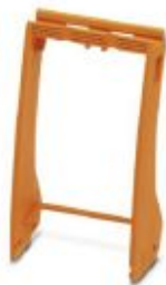
Relay retaining bracket, with holder for marking material, suitable for RIF-4 relay base, for high-power relay

Please be informed that the data shown in this PDF Document is generated from our Online Catalog. Please find the complete data in the user's documentation. Our General Terms of Use for Downloads are valid ( http://phoenixcontact.com/download )