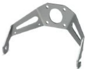
Accessories, bracket connection adapter for a monitor/IPC in IP65 housing

Please be informed that the data shown in this PDF Document is generated from our Online Catalog. Please find the complete data in the user's documentation. Our General Terms of Use for Downloads are valid ( http://phoenixcontact.com/download )