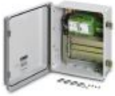
NEMA 4X enclosure for wireless systems

Control cabinet - RAD-SYS-NEMA4X-900 - 2917188