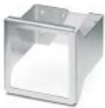
DIN rail adapter for EEM-MA770-X and EEM-MA771-X series energy measuring devices

DIN rail adapter - EEM-MKT-DRA - 2902078