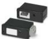
PROFIBUS (1.5 Mbps) communication module for EEM-MA600

Communication module - EEM-PB-MA600 - 2901368