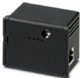
Ethernet communication module for the EEM-MA600 with integrated web server

Please be informed that the data shown in this PDF Document is generated from our Online Catalog. Please find the complete data in the user's documentation. Our General Terms of Use for Downloads are valid ( http://phoenixcontact.com/download )