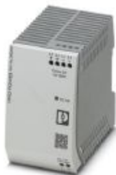
Primary-switched UNO POWER power supply for DIN rail mounting, input: 1-phase, output: 12 V DC/100 W

Please be informed that the data shown in this PDF Document is generated from our Online Catalog. Please find the complete data in the user's documentation. Our General Terms of Use for Downloads are valid ( http://phoenixcontact.com/download )