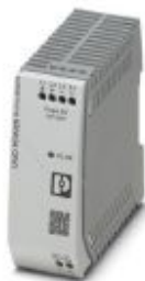
Primary-switched UNO POWER power supply for DIN rail mounting, input: 1-phase, output: 12 V DC/55 W

Please be informed that the data shown in this PDF Document is generated from our Online Catalog. Please find the complete data in the user's documentation. Our General Terms of Use for Downloads are valid ( http://phoenixcontact.com/download )