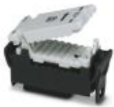
SmartWire DT™ device plug, 8-pos.