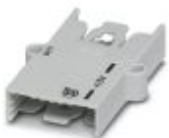
SmartWire DT™ coupling for 8-pos. flat plug

Phoenix Contact 2020 © - all rights reserved http://www.phoenixcontact.com