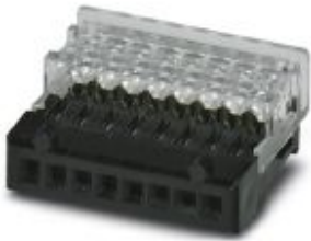
SmartWire DT™ flat plug, 8-pos.

Please be informed that the data shown in this PDF Document is generated from our Online Catalog. Please find the complete data in the user's documentation. Our General Terms of Use for Downloads are valid ( http://phoenixcontact.com/download )