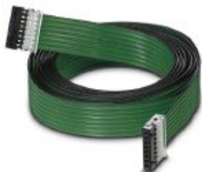
SmartWire DT™ 3 m flat-ribbon conductor, assembled with 2 flat plugs, 8-pos.

Please be informed that the data shown in this PDF Document is generated from our Online Catalog. Please find the complete data in the user's documentation. Our General Terms of Use for Downloads are valid ( http://phoenixcontact.com/download )