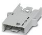
SmartWire DT™ coupling for 8-pos. flat plug