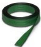
SmartWire DT™ 100 m flat-ribbon conductor, 8-pos.