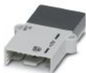
SmartWire DT™ bus termination plug