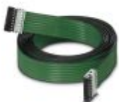
SmartWire DT™ 3 m flat-ribbon conductor, assembled with 2 flat plugs, 8-pos.