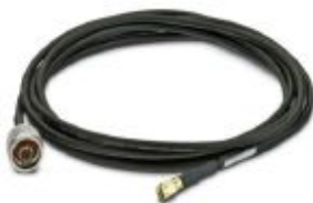
The figure shows a version of the product

Antenna cable, outside diameter: 5 mm (0.2 in.), inner conductor: solid, attenuation: 1.2 / 2.0 / 3.0 dB at 0.9 / 2.4 / 5.8 GHz, connection: N (male) -> RSMA (male), cable length: 3 m (10 ft.)