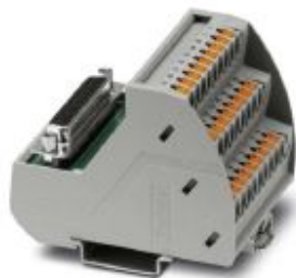
VARIOFACE module, with push-in connections and D-SUB 25 socket connector, for mounting on NS 35 rails

Please be informed that the data shown in this PDF Document is generated from our Online Catalog. Please find the complete data in the user's documentation. Our General Terms of Use for Downloads are valid ( http://phoenixcontact.com/download )