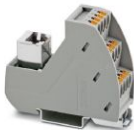
VARIOFACE module with push-in connection and RJ45 connector

Please be informed that the data shown in this PDF Document is generated from our Online Catalog. Please find the complete data in the user's documentation. Our General Terms of Use for Downloads are valid ( http://phoenixcontact.com/download )