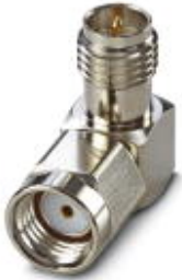
Antenna adapter, frequency range: 0.3 GHz ... 6 GHz, connection: RSMA (male) -> RSMA (female), 90° angled

Please be informed that the data shown in this PDF Document is generated from our Online Catalog. Please find the complete data in the user's documentation. Our General Terms of Use for Downloads are valid ( http://phoenixcontact.com/download )